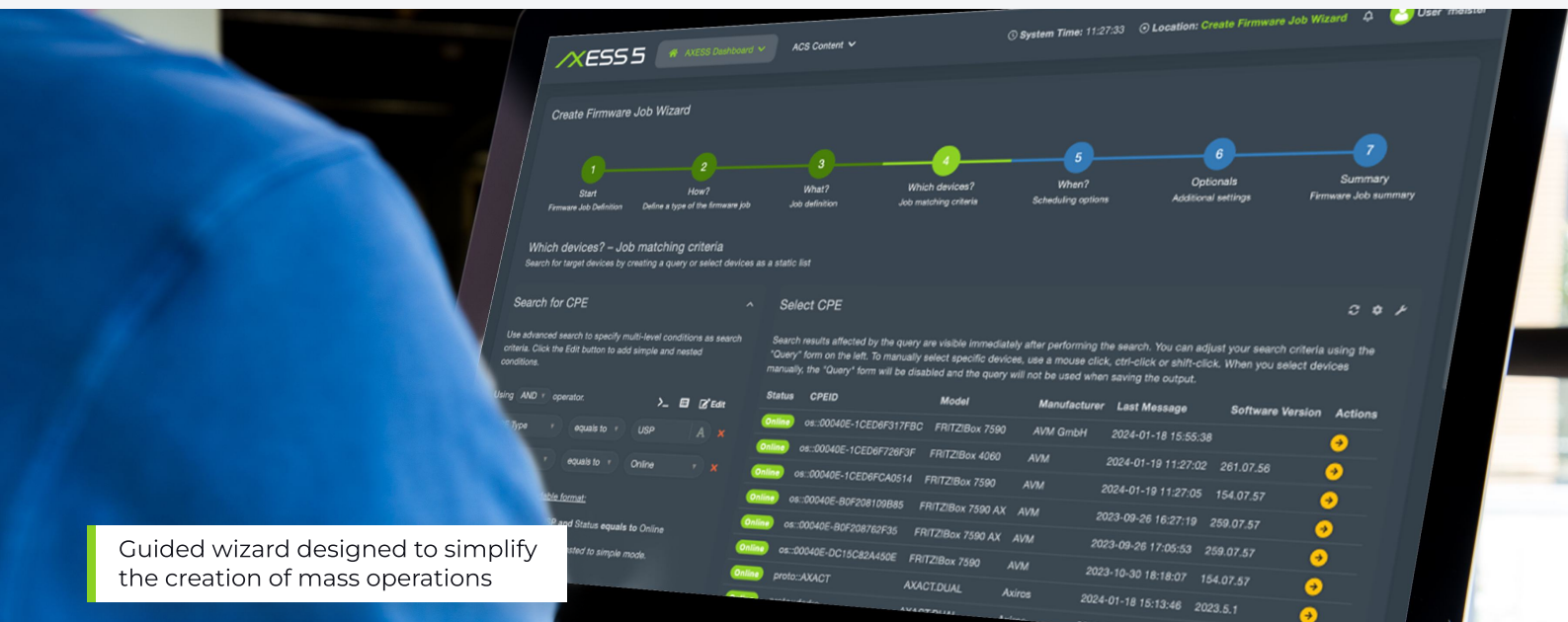
Guided wizard designed to simplify the creation of mass operations